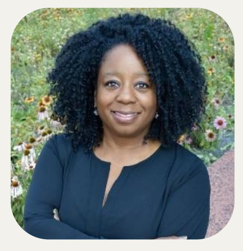
Bio coming soon